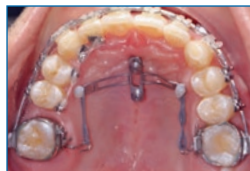
Mesialization of Molars