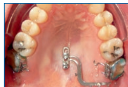
Distalization of Molars